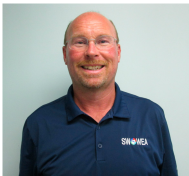
SWOWEA President 2021/2022