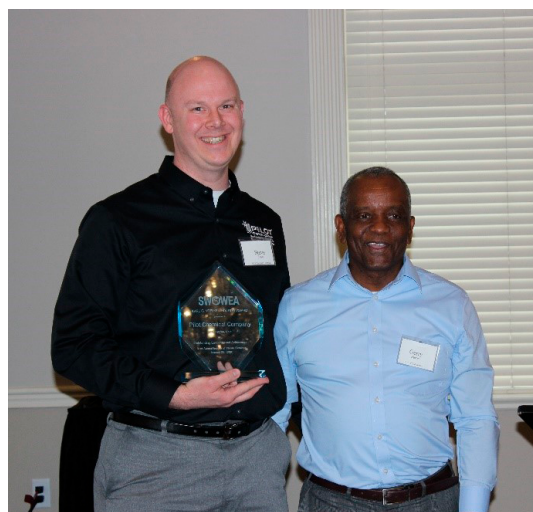
Karl G. Voelkel Industry Award presentation