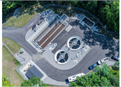
Warren County, OH