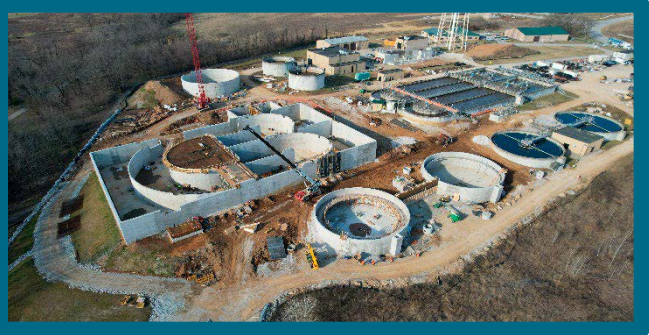
Jeffersonville North WRF Jeffersonville, IN

Cincinnati — Columbus — Louisville — Knoxville — Gainesville