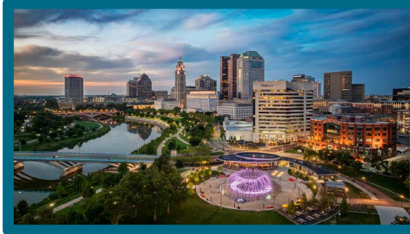
Scioto Mile Fountain Columbus, OH

General Contracting — Design/Build — Construction Management