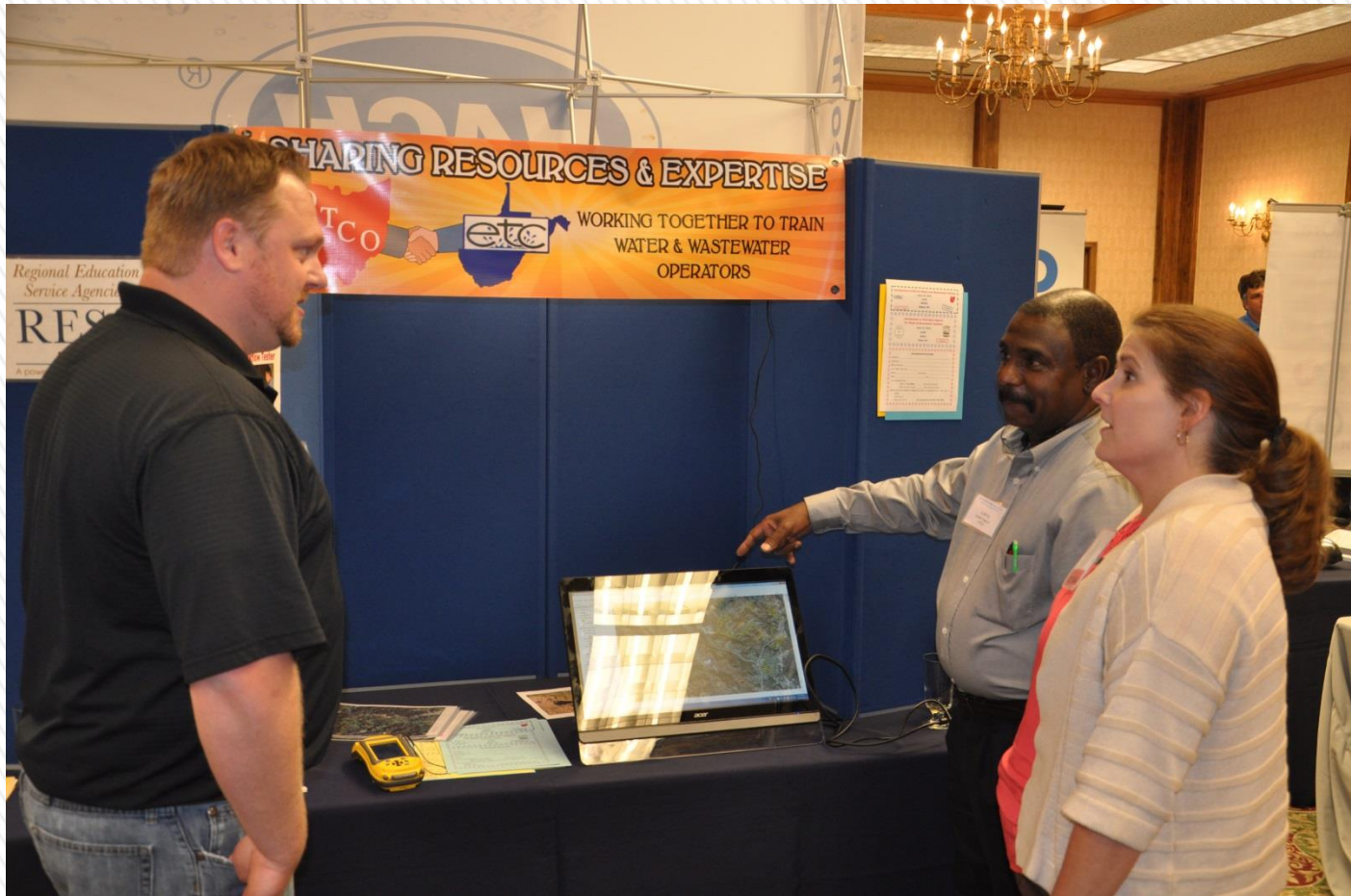
GIS Program featured at ETC booth during 2016 WV AWWA/WEA Conference