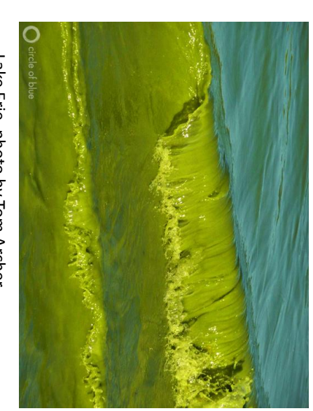
Lake Erie, photo by Tom Archer