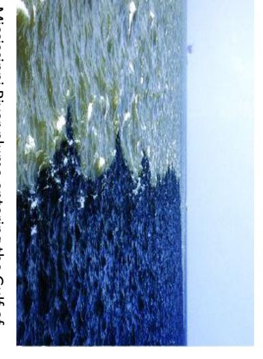
Mississippi River plume entering the Gulf of Mexico