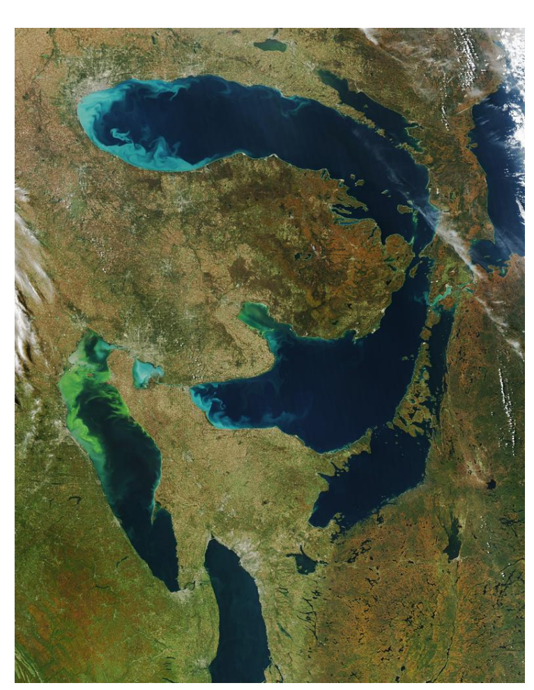
Lake Erie, 2011, algae bloom