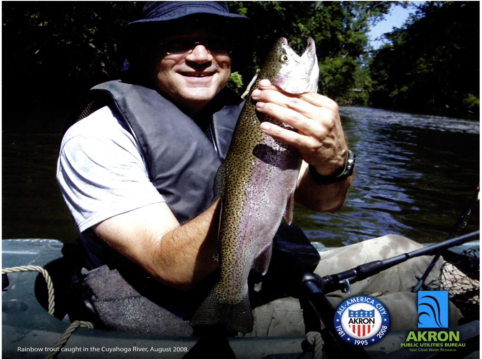
Rainbow trout caught in the Cuyahoga River, August 2008.