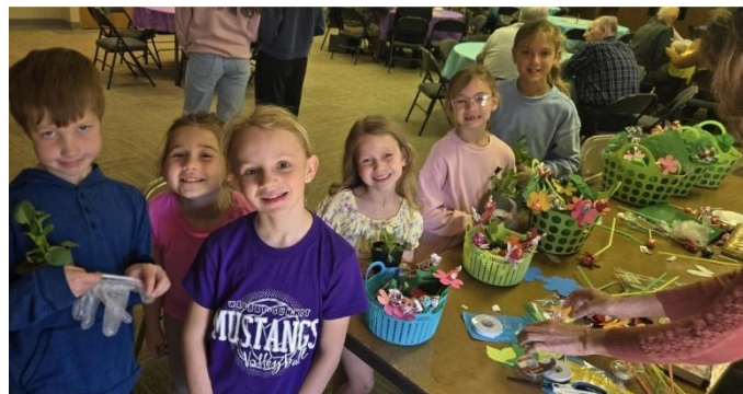
May Day baskets created by Sunday School and Jr FROGS

Thank you to all the volunteers and families who make our Board of Education programs so vibrant. We look forward to seeing you in the halls this May!