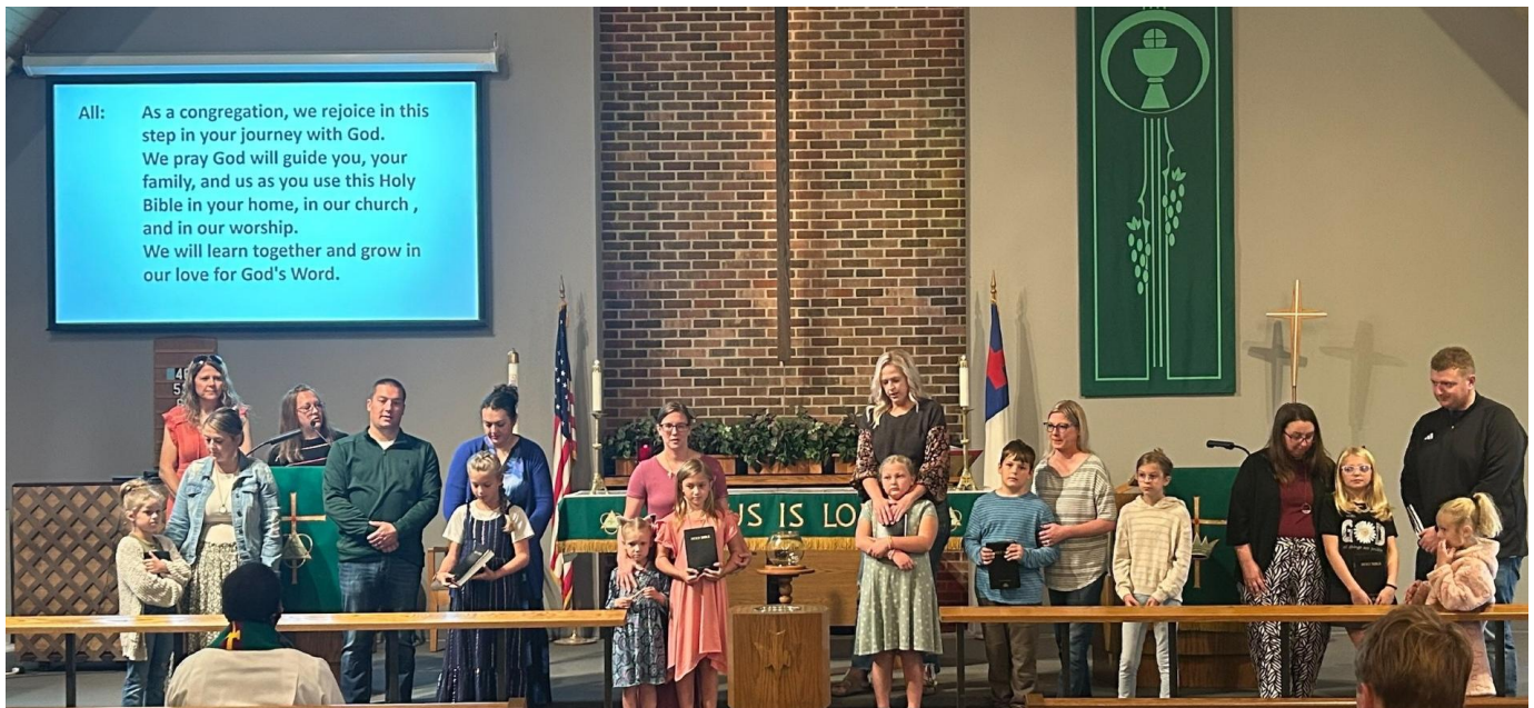
Parents and family joined the 3 rd graders for the presentation of the bibles on Sunday, September 28.