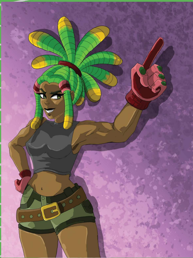
“ASTRID” by Aliya Burnside