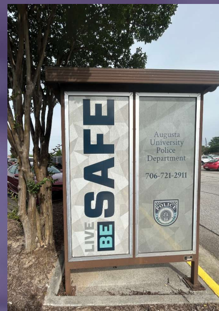
AUPD posts safety reminders across both campuses and offers several safety resources to the AU community.