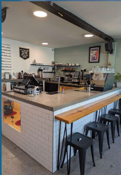
Relic coffee shop is located on Monte Sano Avenue in Augusta.