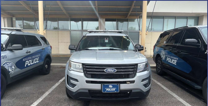
Augusta University Police Department vehicles are parked at their 15th Street headquarters.