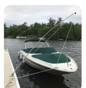
Premium Mooring Whips