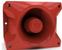
Industrial horns, sirens, sounders