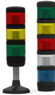
Visual indication for status, alert & alarm as well as audible warning