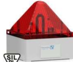
Alarm safety in any environment