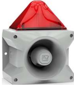
Horns, sounders, sirens with flashing strobe light