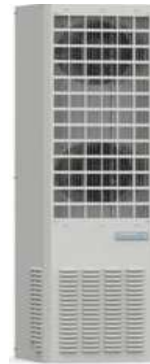
Enclosure cooling units (air conditioners)