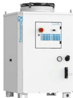
High quality components for maximum performance