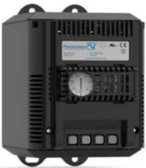
Additional protection for your electronics