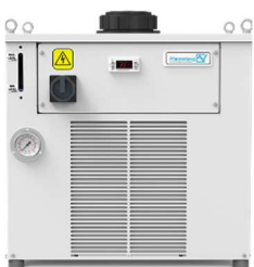
Compact, packaged, and ready to use