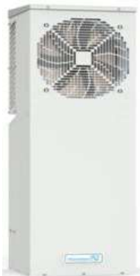
Efficient cooling with ambient air