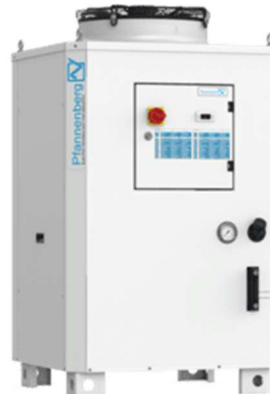
Maximum efficiency with inverter technology