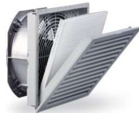
Trust in the Original