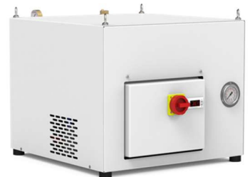
Ensuring longer service life while saving energy