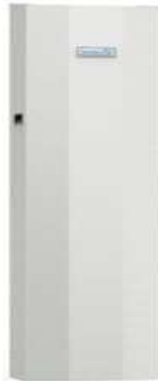
Cooling for when ambient conditions are at their worst