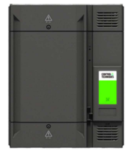
Flexible and reliable high-power solutions