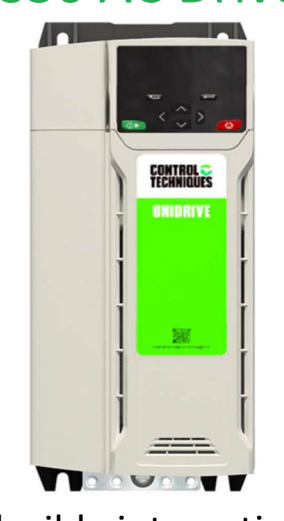
Flexible integration with safety and communications