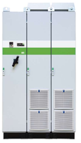
Pre-engineered packaged drives