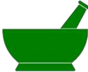
Mortar and Pestle