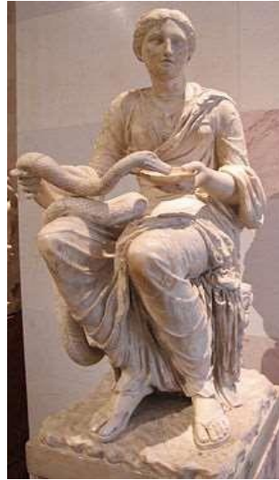
Hygieia (Goddess of health, cleanliness and sanitation)