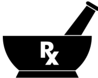
Mortar and Pestle