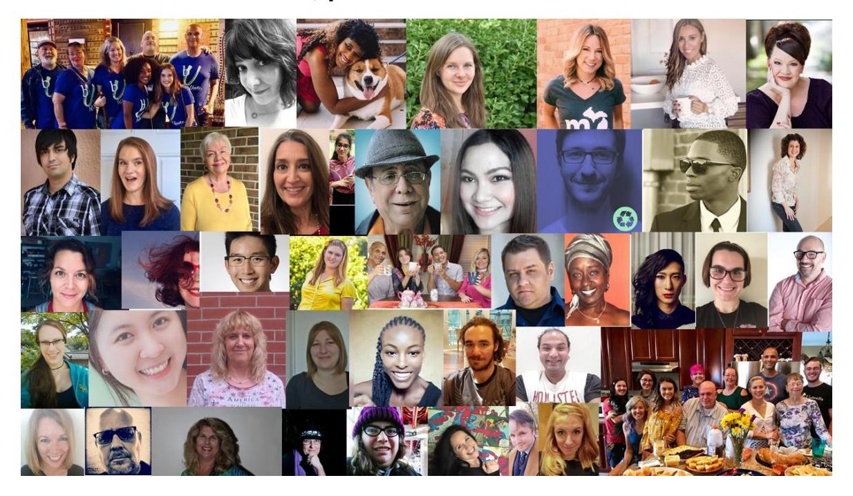
Then, you came into our world.

You've added your own special flair and the organization will thrive because of your involvement. I love that we've attracted the attention of people from all over the world, but I have moments of discouragement when I see how many people have volunteered, yet how few actually interact with us. I get it.