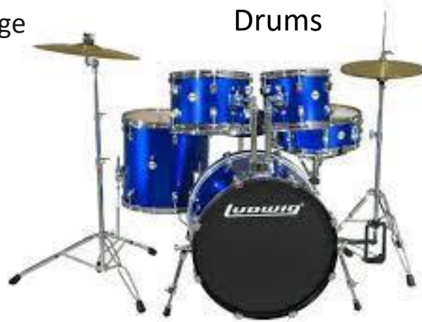
Bruce Oblinger Drums