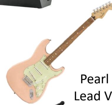
Pearl Pop Lead Vocals & Rhythm Guitar