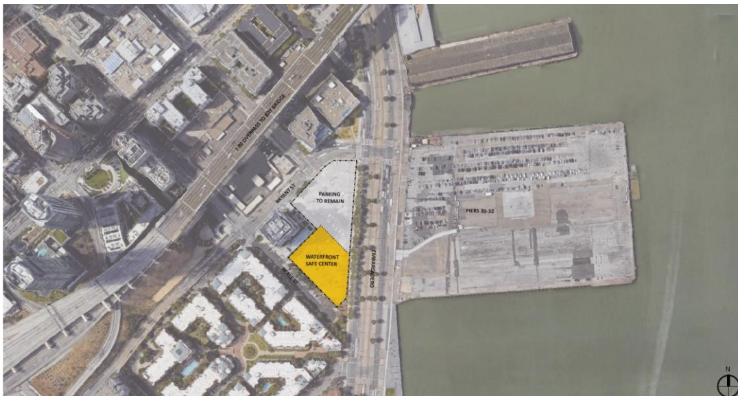
Figure 1: Proposed Location on Port Property

The proposed Embarcadero SAFE Navigation Center will occupy approximately 46,600 square feet of enclosed area including approximately 10,500 square feet of outdoor space for courtyards and circulation (approximately half the size of Seawall Lot 330). Figure 1 below shows the location of the proposed facility. Figure 2 shows a concept plan.