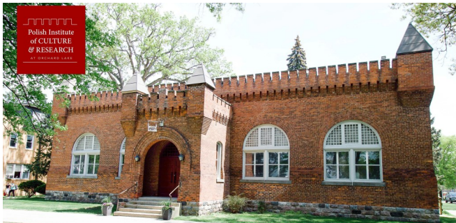
Polish Institute of Culture and Research Galleria

TOUR COST INCLUDES MUSEUM ADMISSION, LUNCH, AND TRANSPORTATION