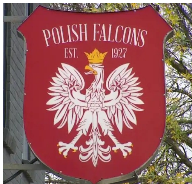
PHS Rozmowa Club will meet at the Polish Falcons Feb 7th