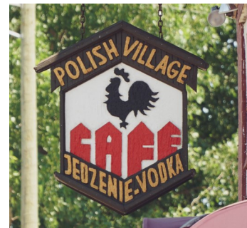
Lunch Stop in Hamtramck

*****Reservation Deadline Saturday, March 15, 2025*****