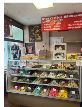
New Palace Bakery case

Happy shoppers were able to get some special items to take home to Grand Rapids for their Easter baskets.