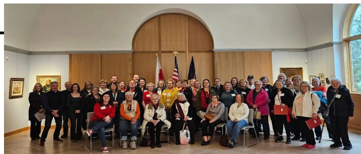
PHS Members Tour the Polish Institute of Culture and Research

which is published by the Liturgical Center and distributed in the US and Canada.