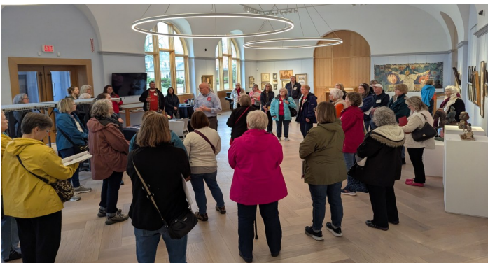
Detroit Polonia Bus Tour participants at the Galeria Tour.

The beautiful campus on the shore of Orchard Lake, is now the home of Saint Mary's Preparatory High School, The Shrine of Saint John Paul II and the Saint John Paul II Liturgical Center. If you ever attended any Catholic Masses conducted in Polish here in the US, you may have used the bilingual Polish/English Missal "Pan z Wami" (The Lord be with you)