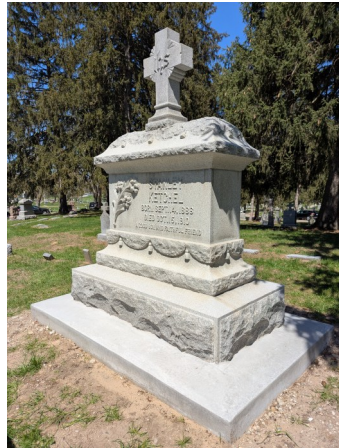
Restored Ketchel Monument

chain. He also has other professional business and industry certifications. Besides serving the PHS, he is active in leadership with the Polish Falcons.