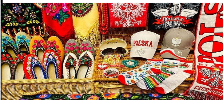
Some of the items available at the Polish Art Center in Hamtramck

Get together with your friends for a fun road trip and register today.