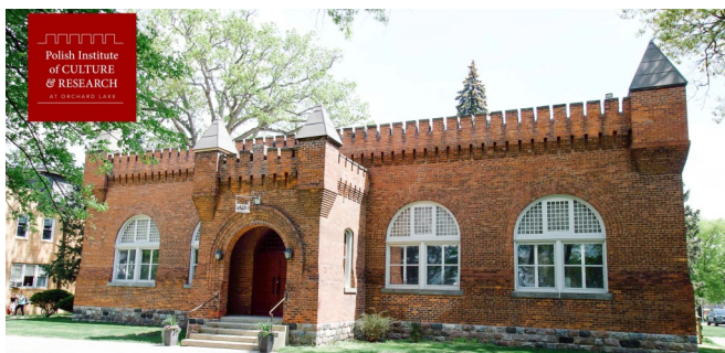
Polish Institute of Culture and Research Galleria

TOUR COST INCLUDES MUSEUM ADMISSION, LUNCH, AND TRANSPORTATION