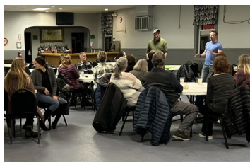
Rozmowa Club Meeting