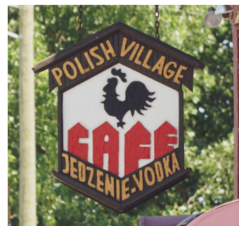
Lunch Stop in Hamtramck

*****Reservation Deadline Thursday March 20, 2025*****