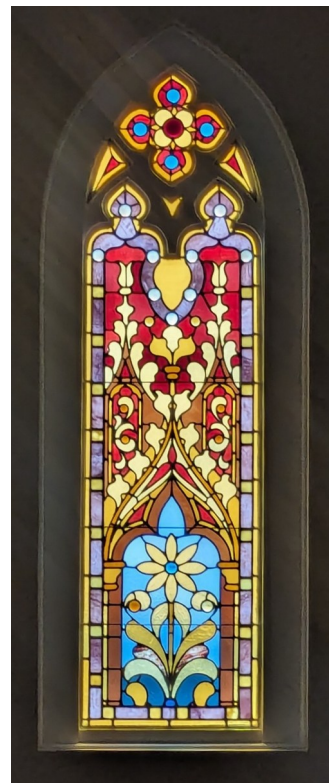
Original St. Adalbert's window which was reinstalled a third time in the present ABVM Chapel

Mary Parish for 75 years before being replaced by the present modern church in 1988.