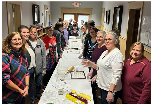
Paczki Cooking Class at Son's and Daughter's Club