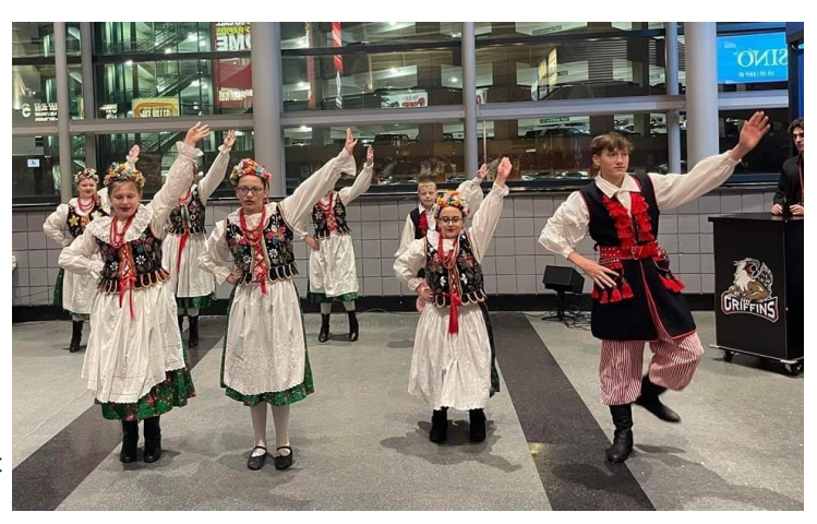
Dancers from the P.R.C.U.A. Malbork Dance Group performed at Polish American night at the Griffins at Van Andel Arena

To support the Polish community, they decided that part of the proceeds should go to a local Polish organization -- and