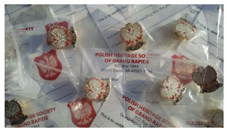
Your membership card is inside in the PHS Member News