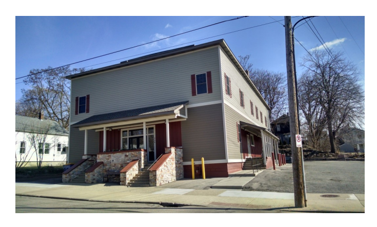
General meeting to be held at Eastern Avenue Hall

The meeting will be held in accordance with the state executive order 2020-147, which states that individu-