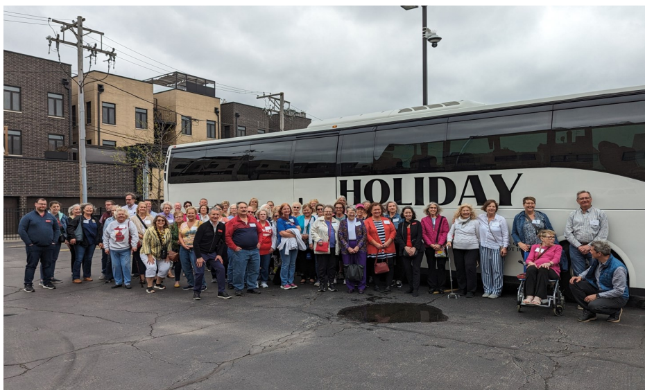
PHS Polska Bus Trip April 27th took 53 people to the Polish Museum of America