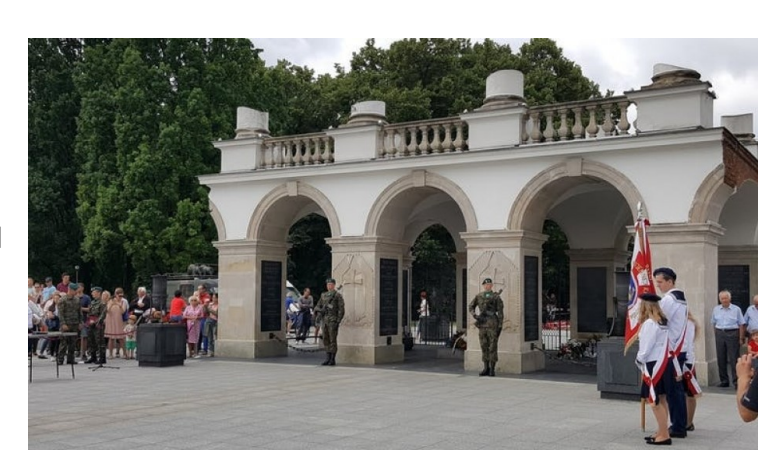
Tomb of the Unknown Soldier in Warsaw