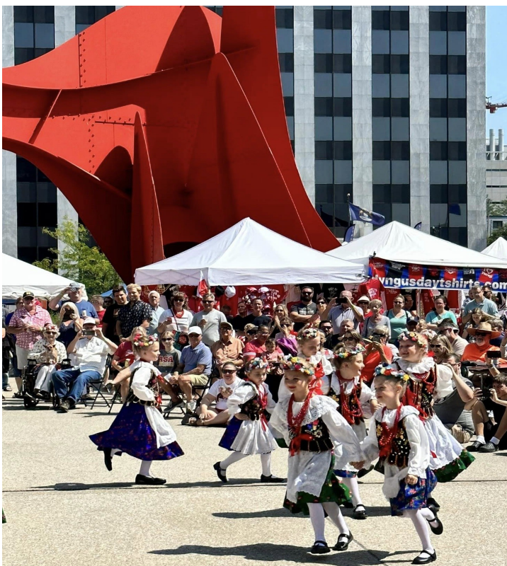
Calder Plaza in Grand Rapids will be filled with everything Polish August 22-24 during the Annual PHS Dozynki Festival