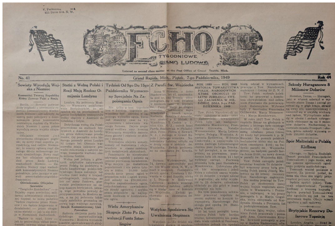
October 1949 issue of the Grand Rapids Echo newspaper with front page stories on the 50 year history of the local Polish National Association, national and international news, obituaries and a reminder to inspect furnaces and chimneys for fire safety with the start of the heating season.