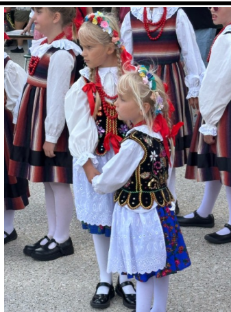
Malbork Dancers preparing to perform for the crowd

The weather was perfect for the festivities at Calder Plaza this year. The Polish hall sign up booth was active this year and we also had 20 new PHS members sign up at Dozynki!