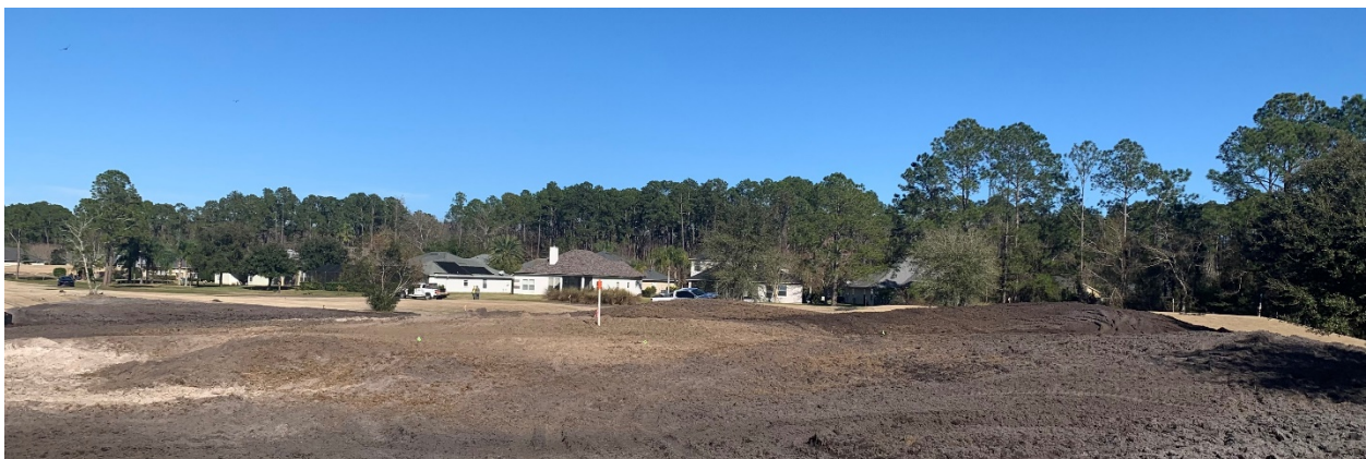
Picture of rough shaping of new 7 green taken from the south-west

Wadsworth's first earth moving was behind the old 16 th green where they diced up the soil for the new location of the future 7 th green. At the same time old irrigation heads and boxes are being removed from holes in preparation for future grading and shaping. The initial construction started on the East side of the course in order to insure the irrigation transfer pump and new pump station were on line as early as possible for the future irrigation of new sod and sprigs. You can really start to see the outline of the new course in this area.