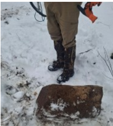
TTR Winter Trail Maintenance

Please read the Ride Coordinator article for more details!