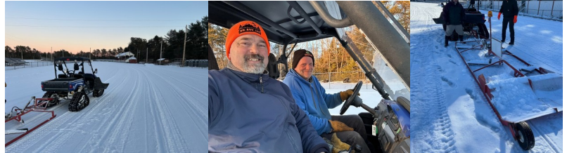
Prepping the track for the SkiJoring event from previous years!

And remember folks when you do head out riding whether here in Topsham or around the state ride right and ride safe! If you have any questions at any time, please do not hesitate in contacting me on my cell phone which is 207-890-8479.