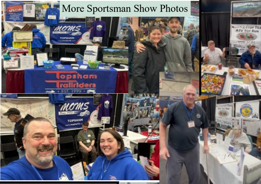
More Sportsman Show Photos