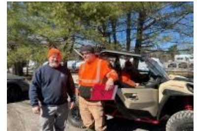
West Side Reroute Prep Work

Without sufficient turnout, our progress will slow down — and that delays trail openings. Every machine, trailer, tool, and set of hands helps us move us closer to opening day, and we appreciate all volunteers who are able to assist and join us as we work to get our trails ready for the season.