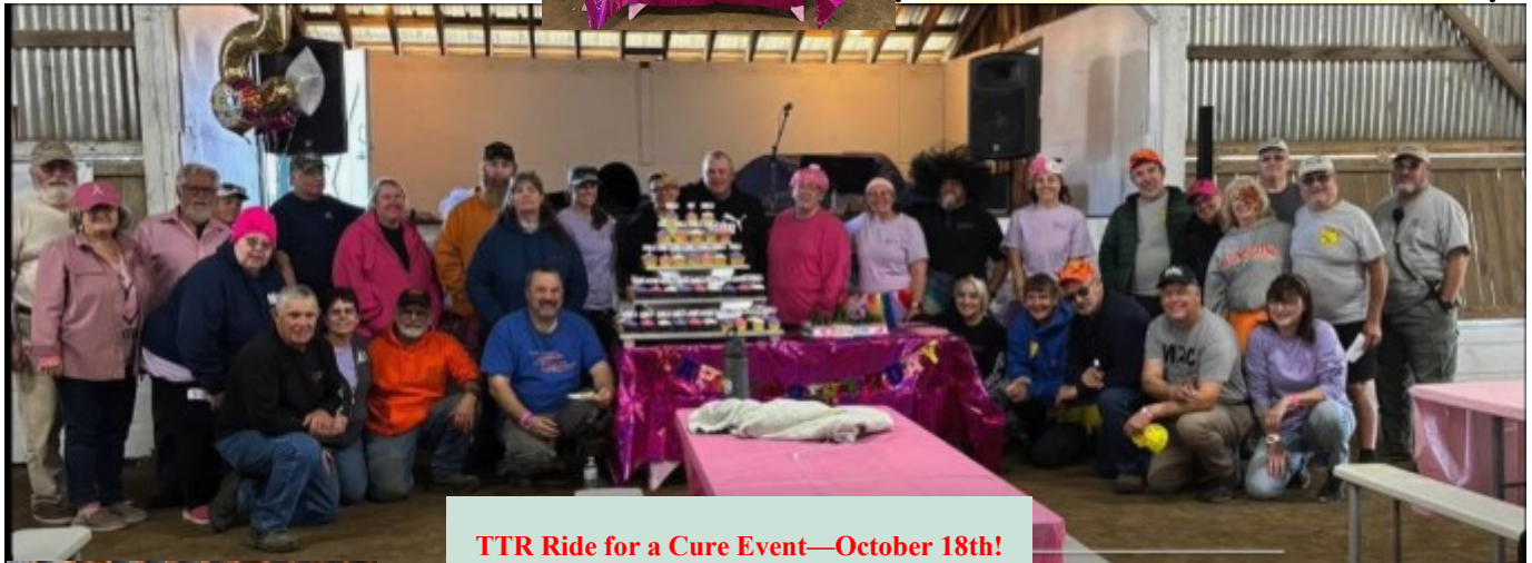
TTR Ride for a Cure Event—October 18th!

Please read the Ride Coordinator article for more details!