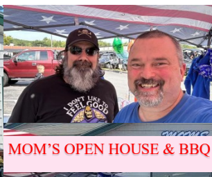
MOM'S OPEN HOUSE & BBQ