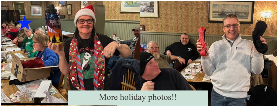
More holiday photos!!