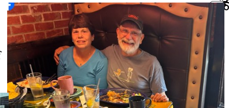
MORE PHOTOS FROM OUR SOCIAL NIGHT