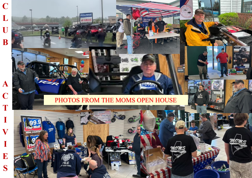
PHOTOS FROM THE MOMS OPEN HOUSE

MaineAutoMall.com Thousands of Vehicles Statewide to Shop Online