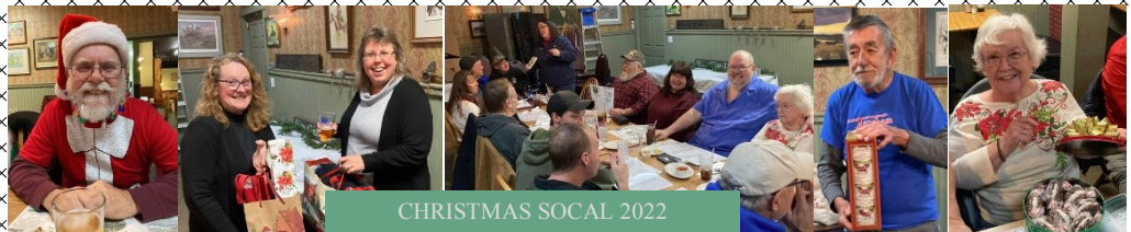
CHRISTMAS SOCIAL 2022

Our Social Night is held on the second Wednesday of each month at 6:00pm. This Month (January) 11th we'll be at Buffalo Wild Wings in Topsham, Maine. Come and enjoy a night on the town with family and friends!