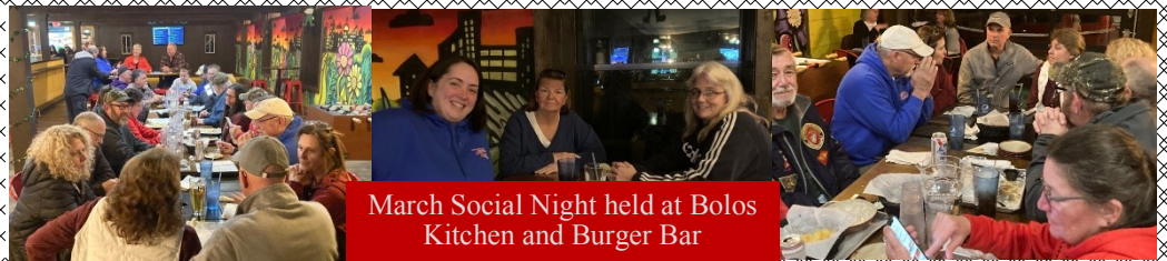
March Social Night held at Bolos Kitchen and Burger Bar

As always be safe and we will soon see you on the trails!