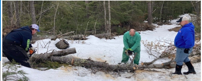
Clearing our Trails!