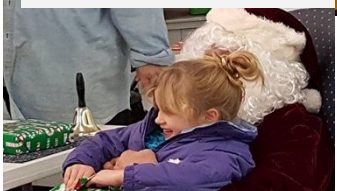
IMAGES FROM OUR CHRISTMAS PARTIES