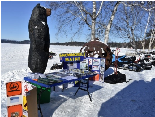
A great weekend at The Rangeley SC's Sno Deo! It was cold but well worth the trip! A great group of snowmobiler's from far and near.