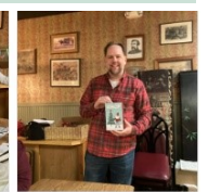
Images from our Christmas Party and the last ATV Ride of the year! Good Times!