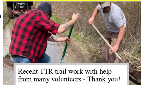
Recent TTR trail work with help from many volunteers - Thank you!