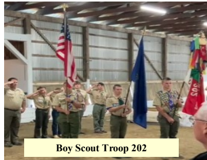
Boy Scout Troop 202