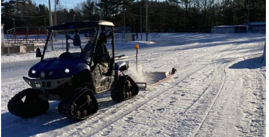
Charlie grooming for SKIJORING RACES!