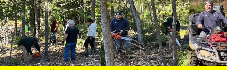
Topsham Trailriders - October Trail Work West Side Party