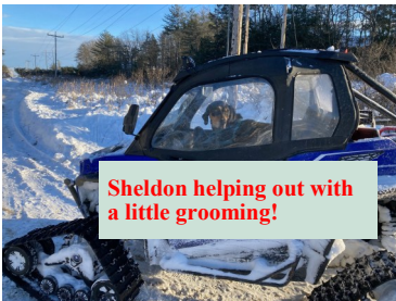
Sheldon helping out with a little grooming!

Before heading out I would recommend that you review our trail map to ensure you are riding on the correct trails. It is worth mentioning that we do have many water crossings and we try to keep an eye on them for your safety. All ice and water crossings are ride at your own risk. If you do notice any thin ice, or come across signs indicating trail closed, please stay off. If you notice something that you think is not safe, please let myself or any of our assistant trailmasters know.