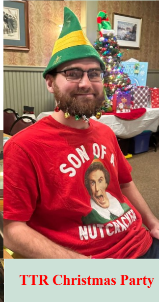
TTR Christmas Party