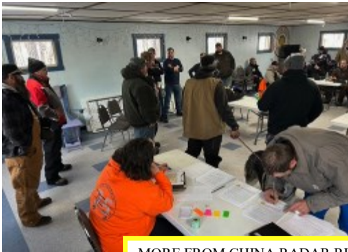
MORE FROM CHINA RADAR RUNS 2025