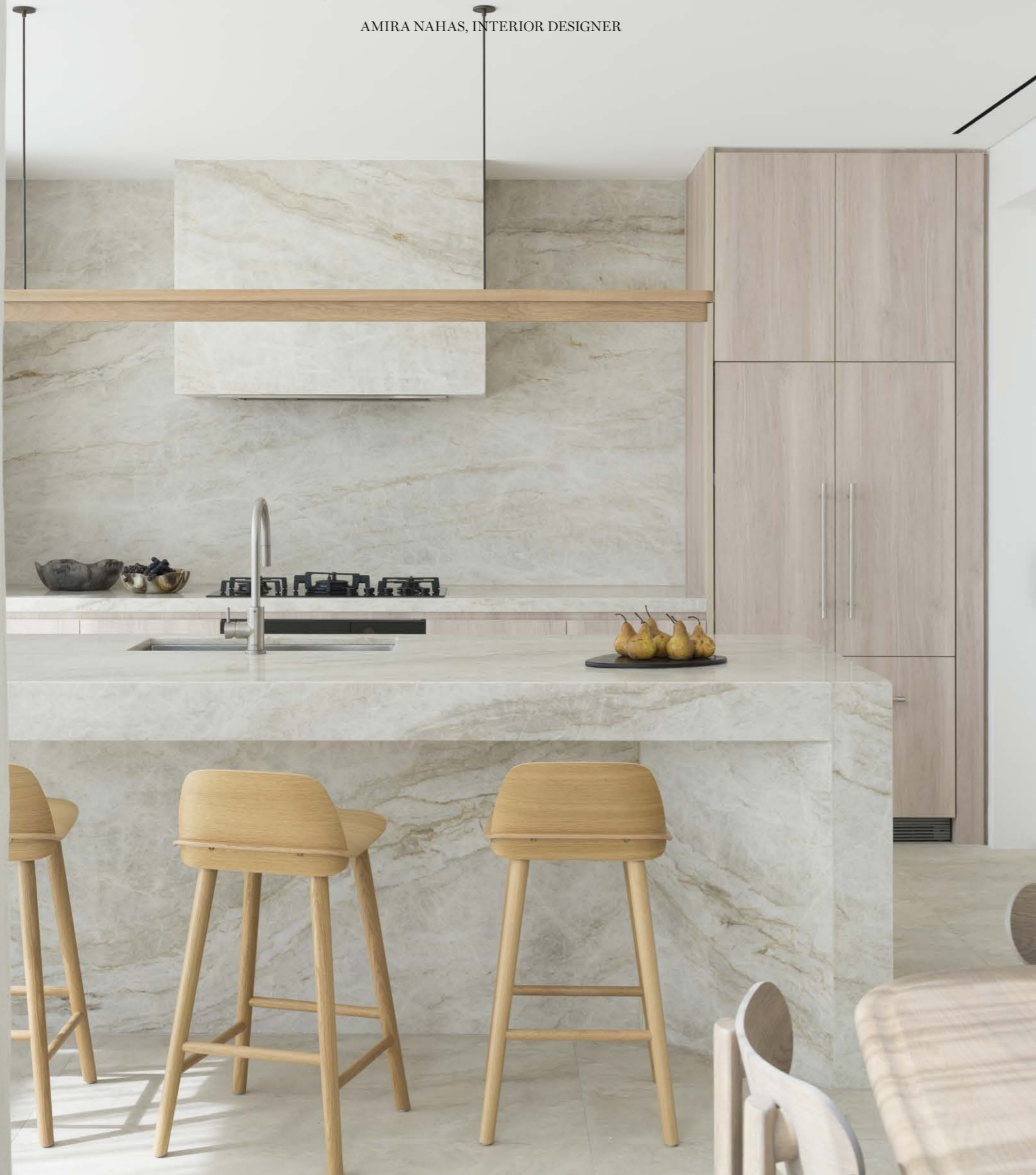
LIVING 'Nina' sofa in Panama Cacao, Jordan. Joinery in Screenwood 'Modulo' panels in NAV Navurban Balmoral. Plinth in Dekton Kraftizen Albarium, Cosentino. Drawers in Polytec Aston White. Fireplace, Escea. Below left Coffee tables, Blend Concrete Design. 'Genoa' rug, Armadillo. HALLWAY 'Florence' floor tiles from Academy Tiles contrast with European ash from Woodcut lining the stairs. KITCHEN Opposite Joinery in NAV Navurban Balmoral. Taj Mahal quartzite, Lux Marble. Pendant, Sabu Studio. Bar stools, Muuto. Mixer, Brodware.