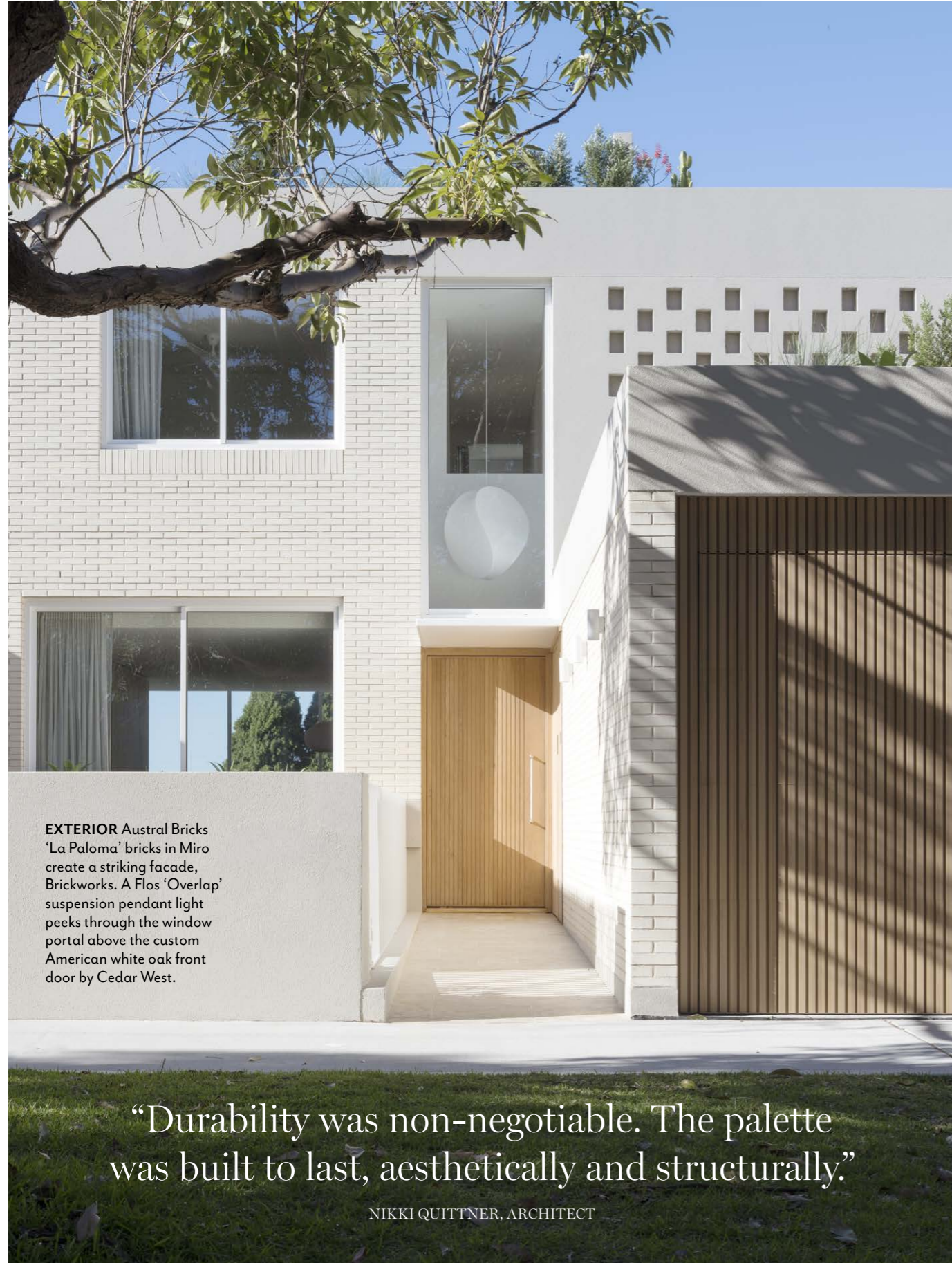
EXTERIOR Austral Bricks 'La Paloma' bricks in Miro create a striking facade, Brickworks. A Flos 'Overlap' suspension pendant light peeks through the window portal above the custom American white oak front door by Cedar West.

“Durability was non-negotiable. The palette was built to last, aesthetically and structurally.”