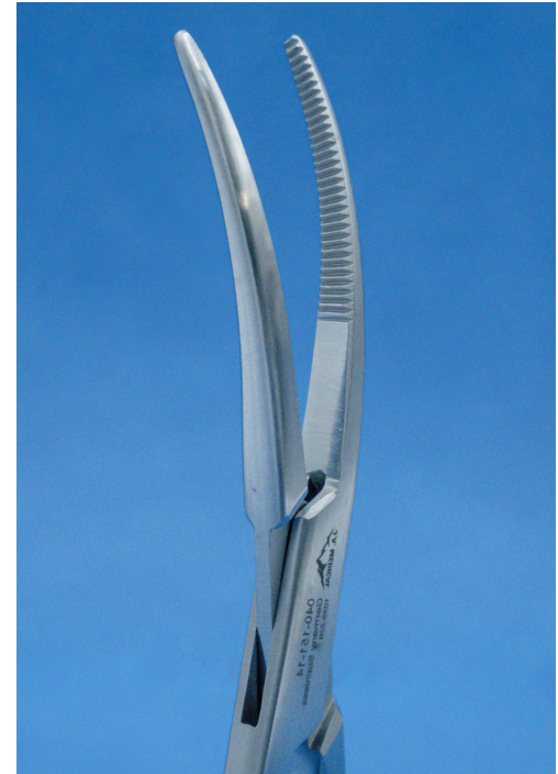
Kelly Hemostatic Forceps Curved 5.5" #040-151-14