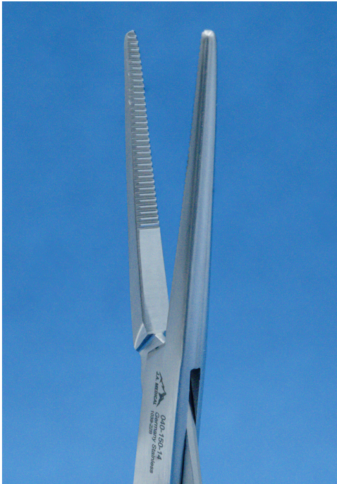
Kelly Hemostatic Forceps Straight 5.5" #040-150-14

Used for ligating small to medium sized blood vessels.