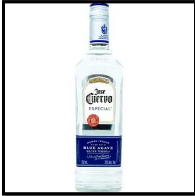
Bottle Jose Cuervo Especial Blue Agave Silver Tequila

RED SHIRT FRIDAY DRAW- ING, Friday, March 31st @ 6 PM. Get your ticket every Friday if you wearing a Red Shirt.