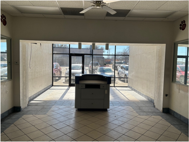
1012 E Ennis Ave