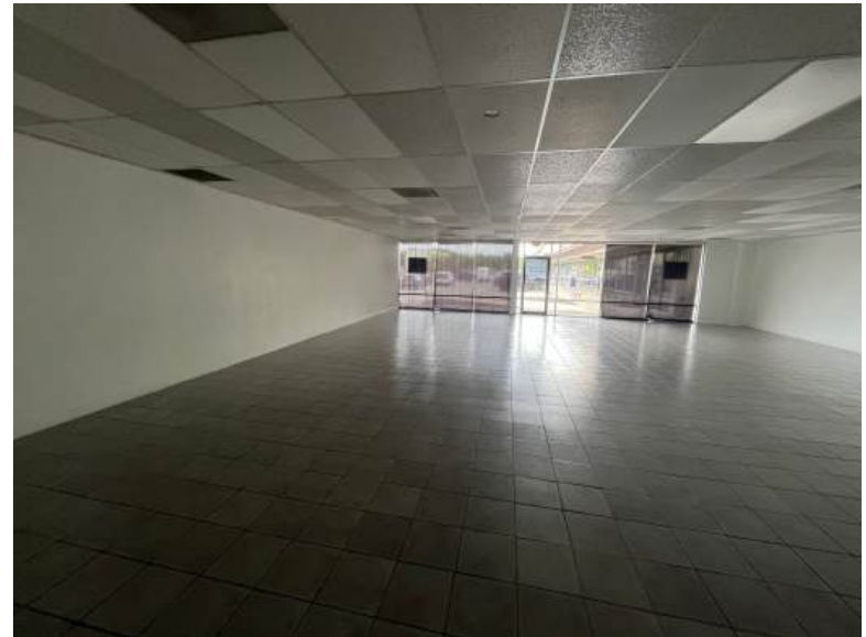
2047 W Main Street