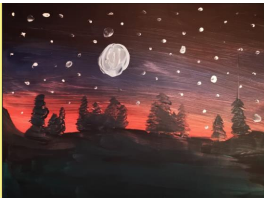
Year 4: Einara