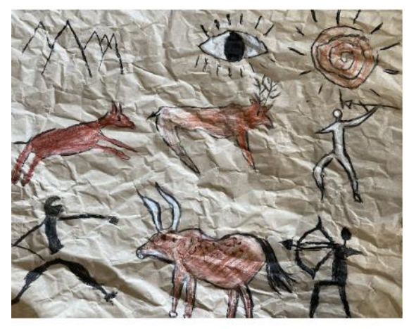
Scarlett - Year 3