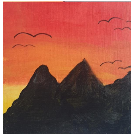
Violet – Year 3