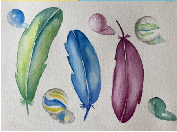
Scarlet Year 4