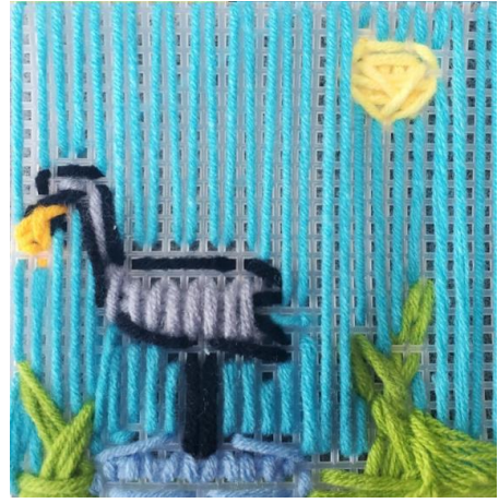
Eleni Year 5