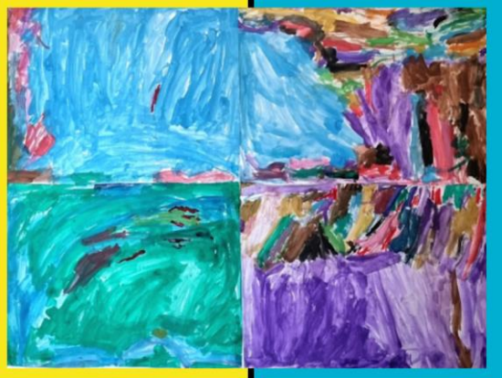
Del – Maple

The children have produced some amazing Art with over 60 entries in the end! Every child who entered the art competition has a chance of their work being displayed at the Young Artists Royal Academy of Arts Show in July. We have displayed our Underhill winners below.